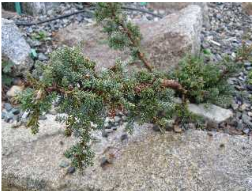
Podocarpus alpinus 'Red tip'

Commonly called Mountain Plum Pine , this is an evergreen shrub native to Australia and New Zealand. The plant's newer name is Podocarpus lawrencei 'Red Tip'. This dwarf shrub has needle foliage that emerges burnished red in spring and matures to dark, blue green. It grows slowly to 1' tall and individual branches may spread to 3' wide with an arching habit. Inconspicuous flowers produce red berries.