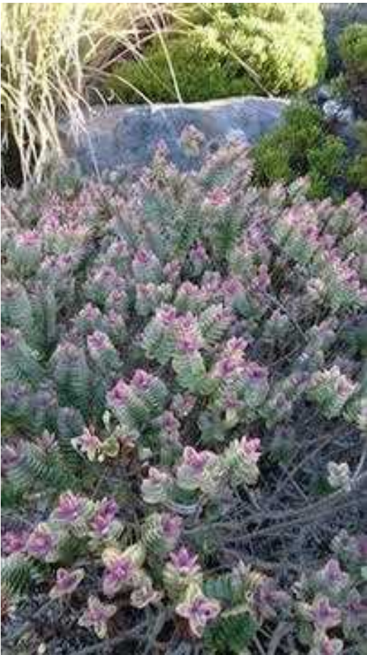
Hebe 'Silver Dollar'. Looks good even in late winter.

The E.H. Lohbrunner Alpine Garden is part of UBC Botanical Garden, The University of British Columbia, 6804 SW Marine Drive, Vancouver, B.C., Canada V6T 1Z4