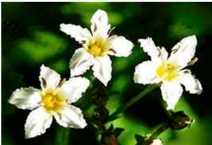
L: Gentiana sceptrum , King Gentian, R: Fauria crista-galli , Deer Cabbage