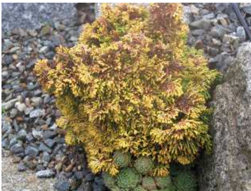
Chamaecyparis 'Verkade's Sunburst'

Commonly called Mountain Plum Pine , this is an evergreen shrub native to Australia and New Zealand. The plant's newer name is Podocarpus lawrencei 'Red Tip'. This dwarf shrub has needle foliage that emerges burnished red in spring and matures to dark, blue green. It grows slowly to 1' tall and individual branches may spread to 3' wide with an arching habit. Inconspicuous flowers produce red berries.