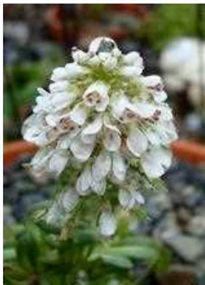
L: Thlaspi bellidifolium , in the rain, first day of Spring

*To fundraise for the garden with a small selection of plants for purchase.