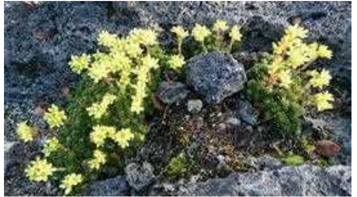
L: pale yellow saxifrage is Saxifraga 'Gregor Mendel', R: bright yellow Saxifraga , cultivar TBC