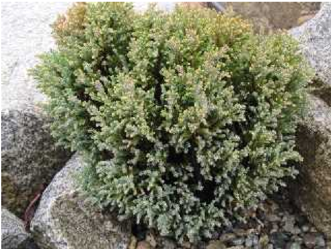
Chamaecyparis pisifera 'White Pygmy'

This Crevice Garden needs small plants, planted into the narrow crevices between rocks all angled in the same direction. And Alpine Shrubs are included with these plants. Our Alpine Gardeners guidance group selected a collection of shrubs and chose how they should be situated in the Crevice. They are all shrubs that can take the summer sunshine and the winter winds and coldness. They can even be used to shade tiny plants around them. Here are three of the shrubs in the Crevice portion of Eswyn's Alpine & Rock Garden.