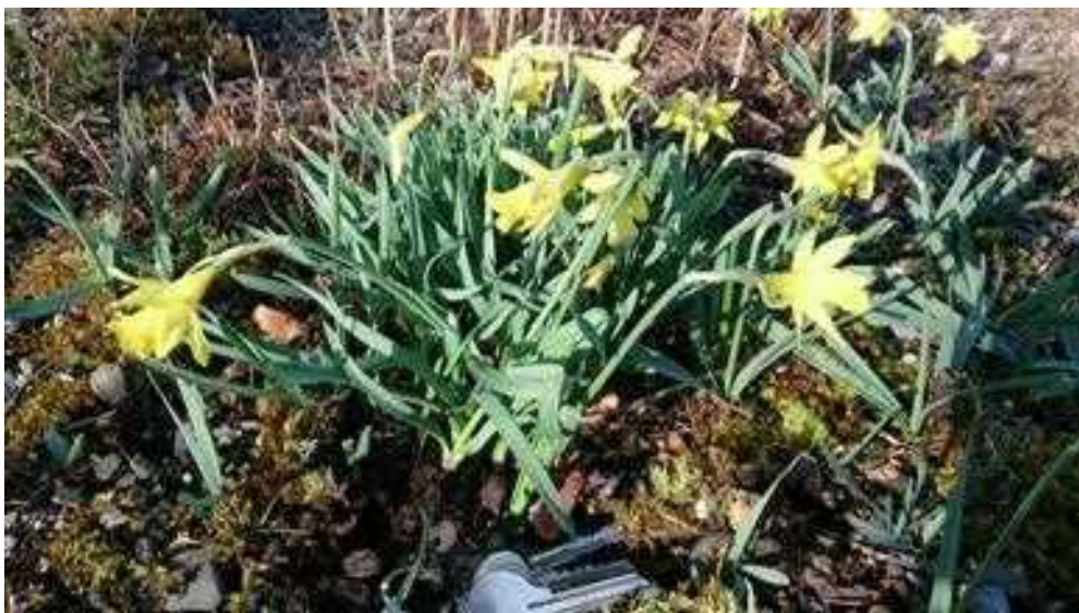
Narcissus minor - very petite!