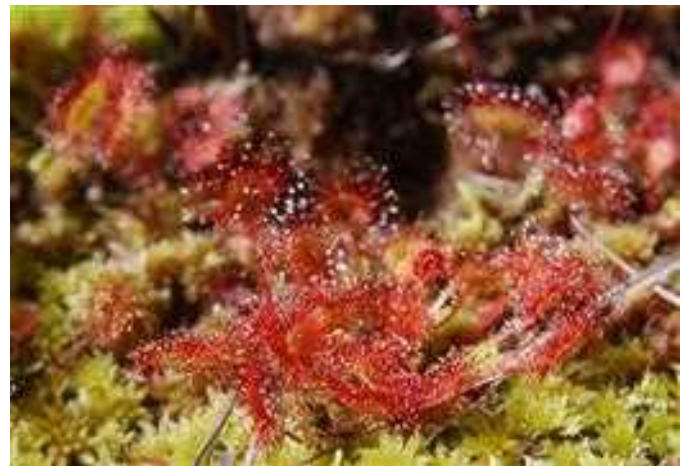
L: Hunting for carnivorous plants, R: Drosera rotundifolia , Round-leaved Sundew