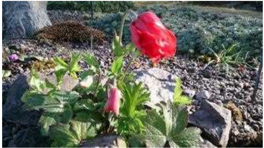
Anemone pavonina , straight from Greece to our west coast, very robust for me.