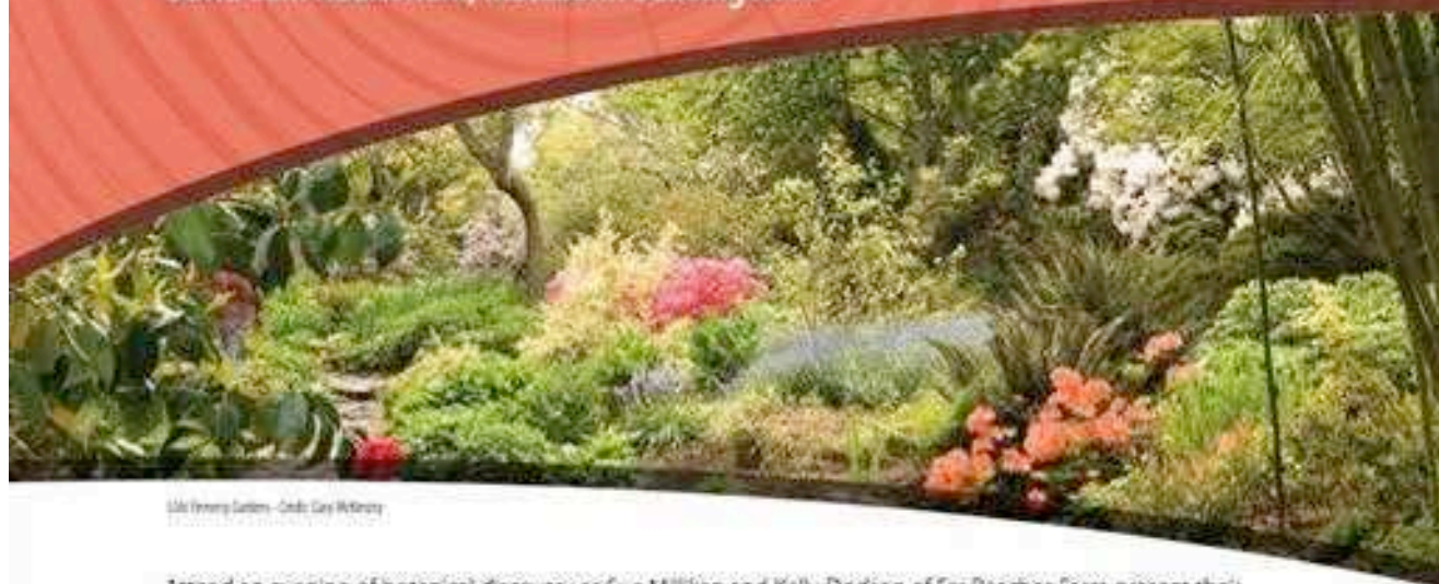
UVic Finnerty Gardens

David Lam Auditorium, MacLaurin building A144