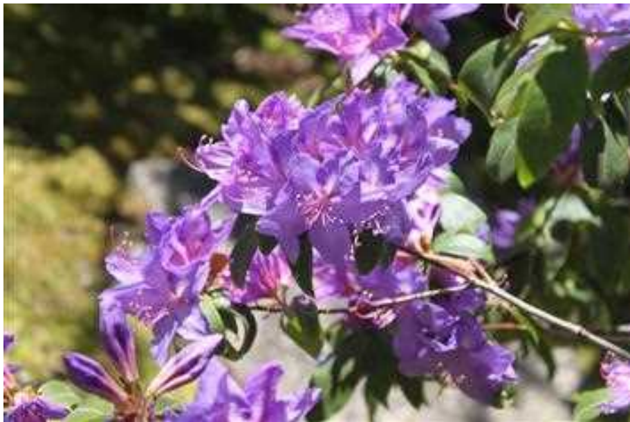
Rhododendron augustinii 'Cerulean Blue'

There are lots of Rhododendrons from very large to quite small, most of them blooming at their very best and many other shrubs and trees - Garry Oak, dogwood, magnolia, cherry, camelia, redwood, dwarf conifers and never forgetting the Douglas Firs! All make a lovely picture.