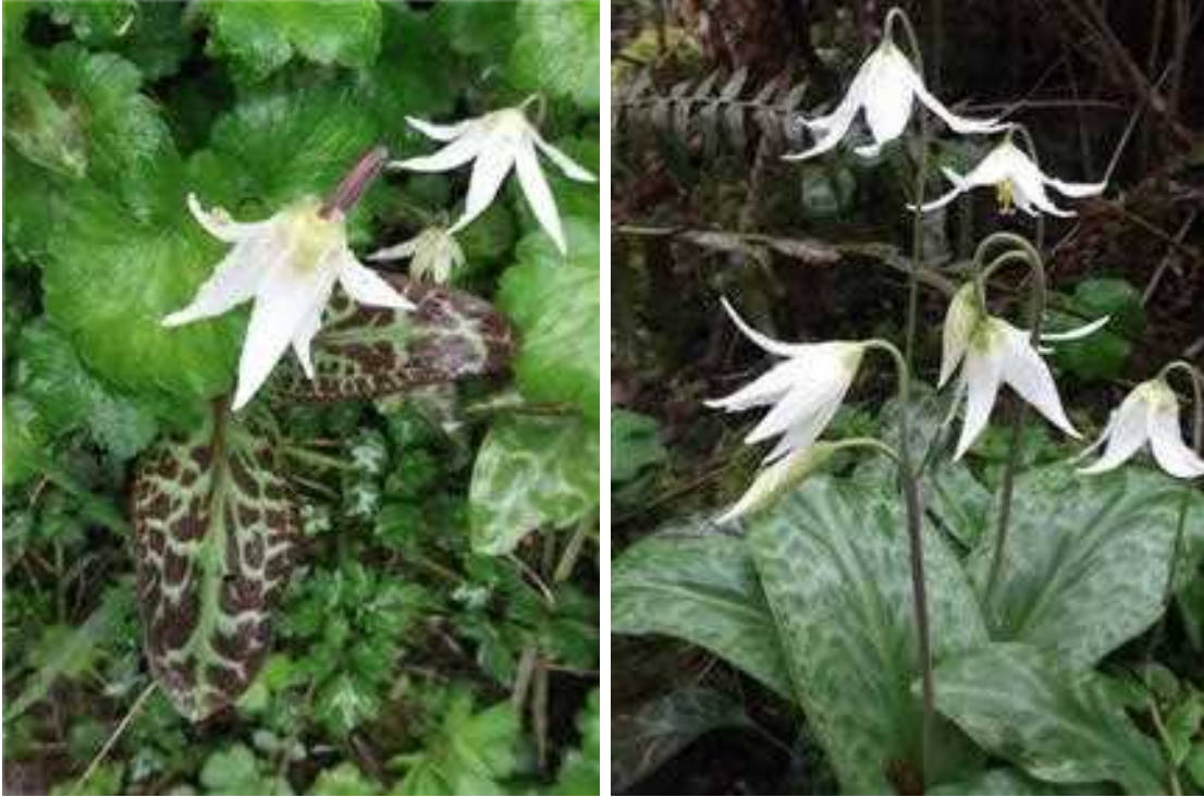
Erythronium oregonum - the one on the left showing particularly dark markings

The Native Plant Group arranged this trip and invited us - we were 6. The day was a bit wet but the flowers didn't mind! The Erythronium were more than ever and our timing was just about right. We found other plants - a wee Anemone , Trillium , yellow violet, Claytonia (Miner's Lettuce), Thalictrum and Aquilegia ?? - we have to go back to check out this one.