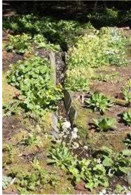
Paddy's stream with Primula

The camas were still to come. Sadly the rescued Calypso bulbosa does not seem to have survived - but give it another year, it came back last year so maybe it's having a little sulk!!