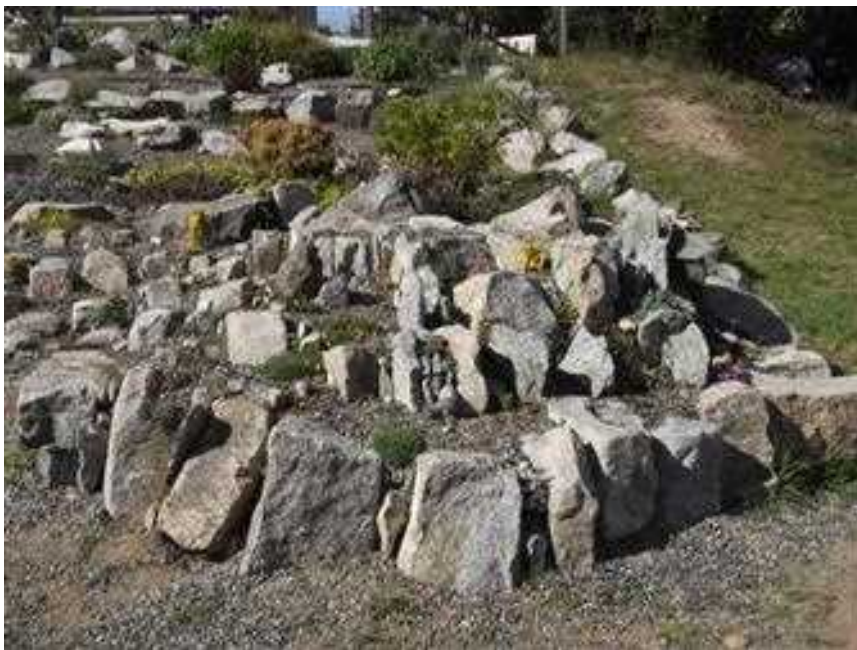
The Crevice Garden showing plants starting to fill out.

The rock garden was almost at its best, but of course weeds need to be pulled before they can set and scatter seed. The Alpine Group gathers in preparation for a pulling session.