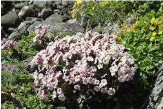
The Natural Rock Garden

Both days were perfect to see this beautiful garden. A Hidden Treasure, I think Mike called it! A natural rock garden where Paddy is encouraging her alpines to grow, we all envy those rocky out-crops!