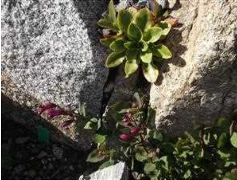
Lewisia & Penstemon in a crevice bed