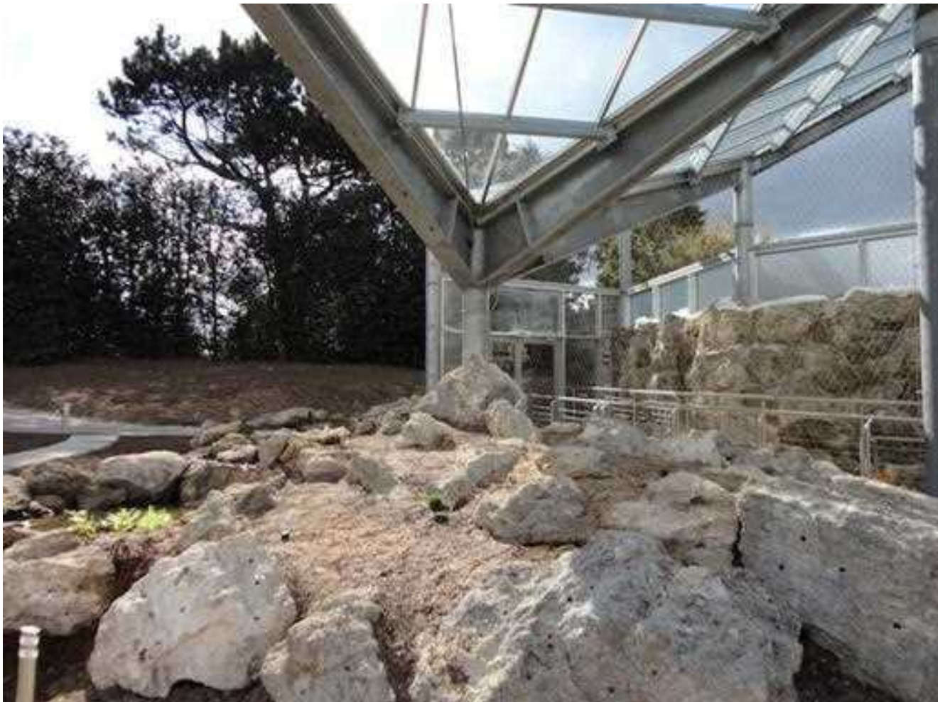
(from May 14 th showing many holes and some plants)

"Things are progressing well in the alpine house. We have drilled 600 holes 300 inside and the same outside which took 2 of us a week to do and about 4 drill bits. Never want to do that again and now we are planting the wall up which is great. The light at the end of the tunnel." John promises us a fuller report on the project in a future issue.