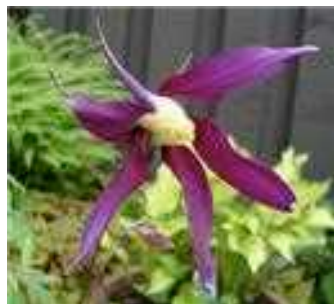
Shade Garden Columbine